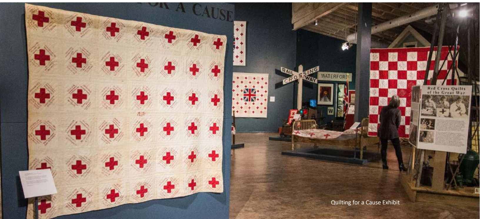
Quilting for a Cause Exhibit

The Our Community Series continued this year with two special exhibits to help showcase historical aspects of the community. The Norfolk Mastodon was relaunched and included newly discovered history and images. Number Please! A History of the Dominion Telephone Company highlighted Waterford's telephone factory – once the 3 rd largest in Canada. A special joint Waterford & Townsend Historical Society and WHAM gallery talk was presented by the Bell Homestead as part of this exhibit.