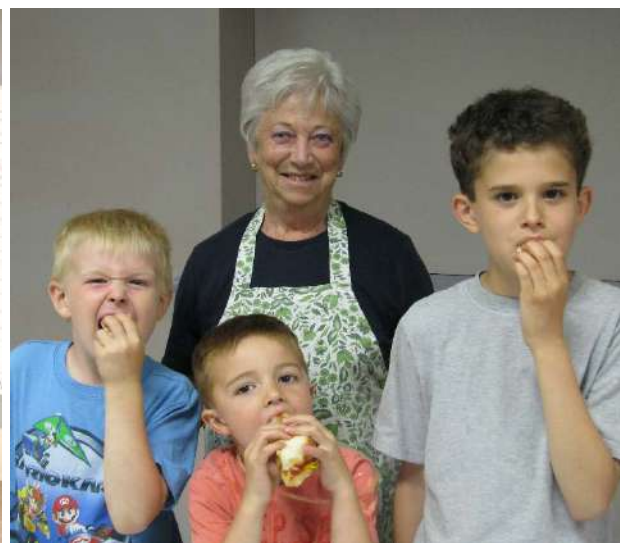
WHAM volunteers helping with EGGstravaganza, exhibit photography, and youth programs