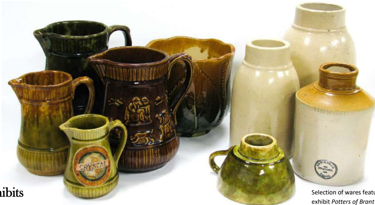
Selection of wares featured in the exhibit Potters of Brant & Norfolk