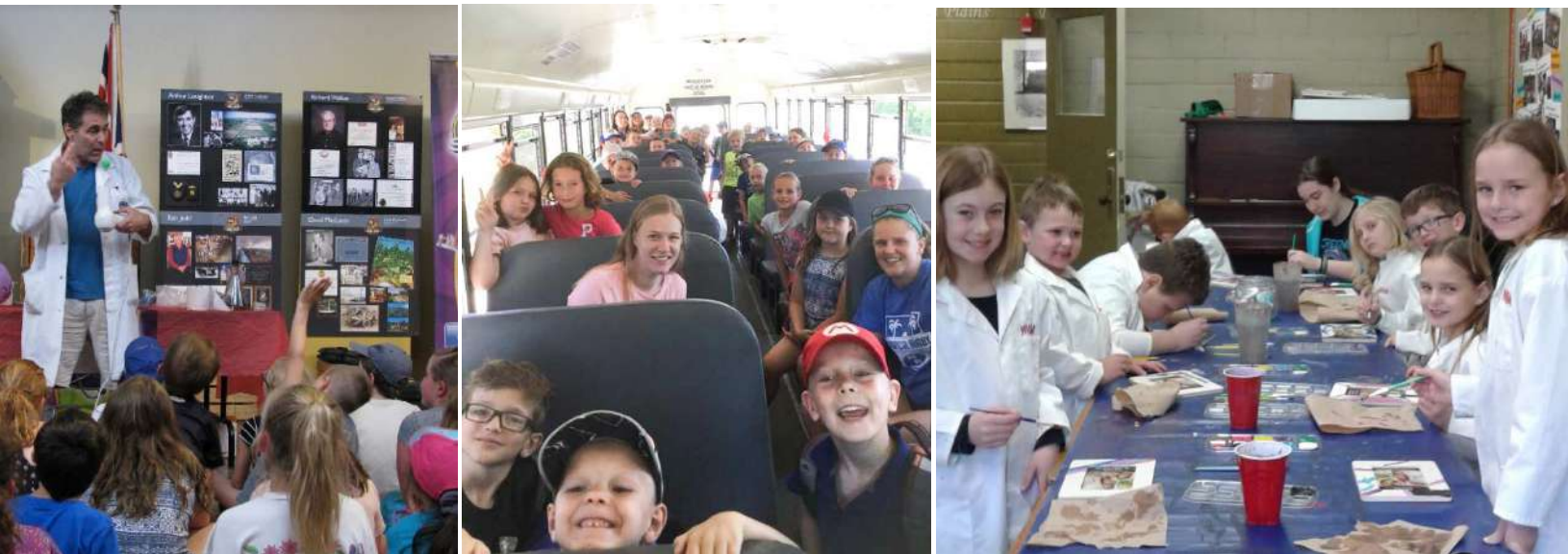
Kids Camp: Mad Science workshop, bus trip to the zoo, and March Break programs

This year's Summer Camp was held five days a week over an eight week period and included a number of educational based activities and special projects for children ages 5 to 11. Summer staff and youth volunteers utilized the museum space to create, explore, and inspire. Field trips included a visit to the Brantford Zoo in partnership with the Delhi Tobacco Museum camp, and a special presentation by Mad Science. A total of 51 youth participated throughout the summer, generating $16,223.00 in revenue . The summer ended with WHAM's hugely popular Night at the Museum.