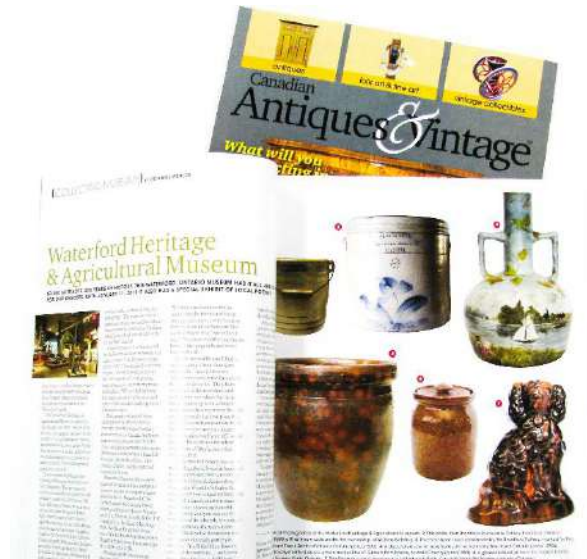
WHAM featured in the national magazine Canadian Antiques & Vintage

This exhibit explored the rich heritage of pottery production in both Brant and Norfolk County throughout the 19 th and early 20 th century. Following nearly a year of research, a total of 109 pieces from museum and private collections were exhibited. A full-colour exhibition catalogue was also produced to accompany the exhibit – a first for WHAM . As a result of the exhibit's overwhelming success, the museum was featured in the national magazine Canadian Antiques & Vintage .